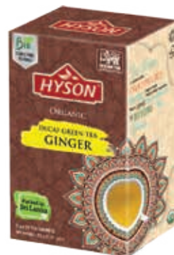
ORGANIC DECAF GREEN TEA GINGER 2g x 20 ENVELOPES