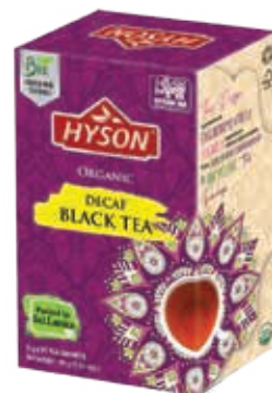
ORGANIC DECAF BLACK TEA 2g x 20 ENVELOPES