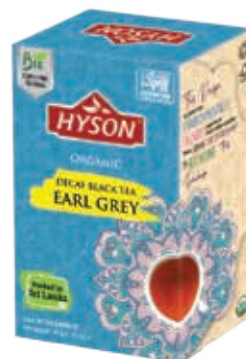
ORGANIC DECAF BLACK TEA EARL GREY 2g x 20 ENVELOPES