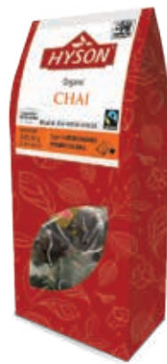
ORGANIC BLACK TEA CHAI