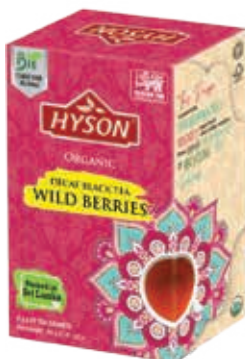
ORGANIC DECAF BLACK TEA WILD BERRIES 2g x 20 ENVELOPES