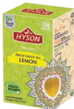
ORGANIC DECAF GREEN TEA LEMON 2g x 20 ENVELOPES