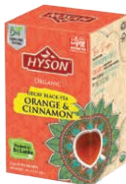
ORGANIC DECAF BLACK TEA ORANGE & CINNAMON 2g x 20 ENVELOPES