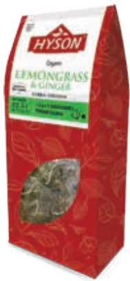
ORGANIC LEMONGRASS & GINGER