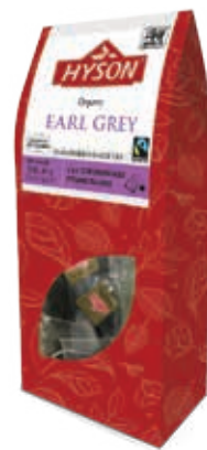
ORGANIC EARL GREY

2g x 15 biodegradable pyramid tea bags in each pack for black tea and green tea