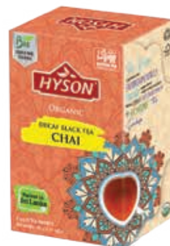
ORGANIC DECAF BLACK TEA CHAI 2g x 20 ENVELOPES