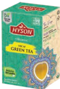
ORGANIC DECAF GREEN TEA 2g x 20 ENVELOPES