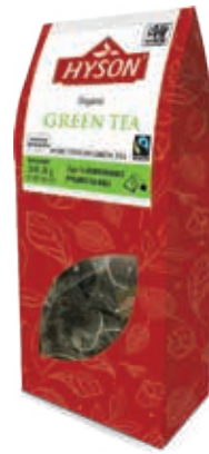
ORGANIC GREEN TEA