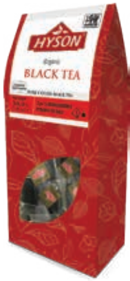
ORGANIC BLACK TEA